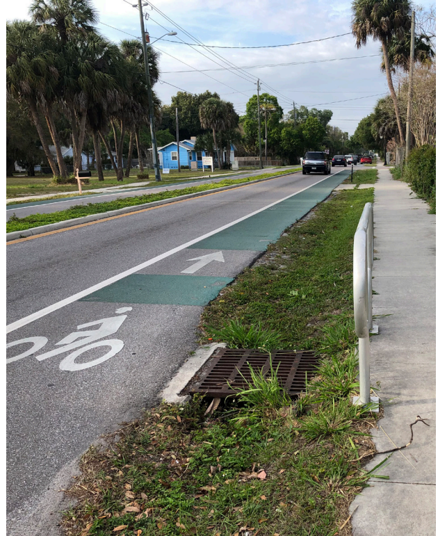
Example of a complete street in Sarasota with bike lanes, landscape buffer and sidewalks

Potential improvements may include adding bike lane, wider sidewalks, lighting, drainage, multi-use pathway, undergrounding of utilities, and landscaping enhancements.