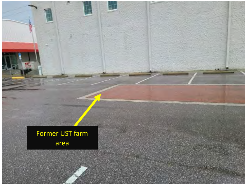
Site 24 – Sarasota Transfer Co. 10 th Way looking southeast