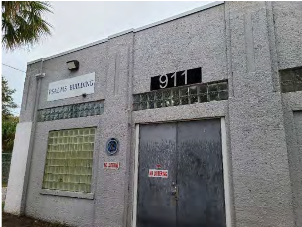
Site 12 – FL Avenue Studios Central Avenue looking southwest