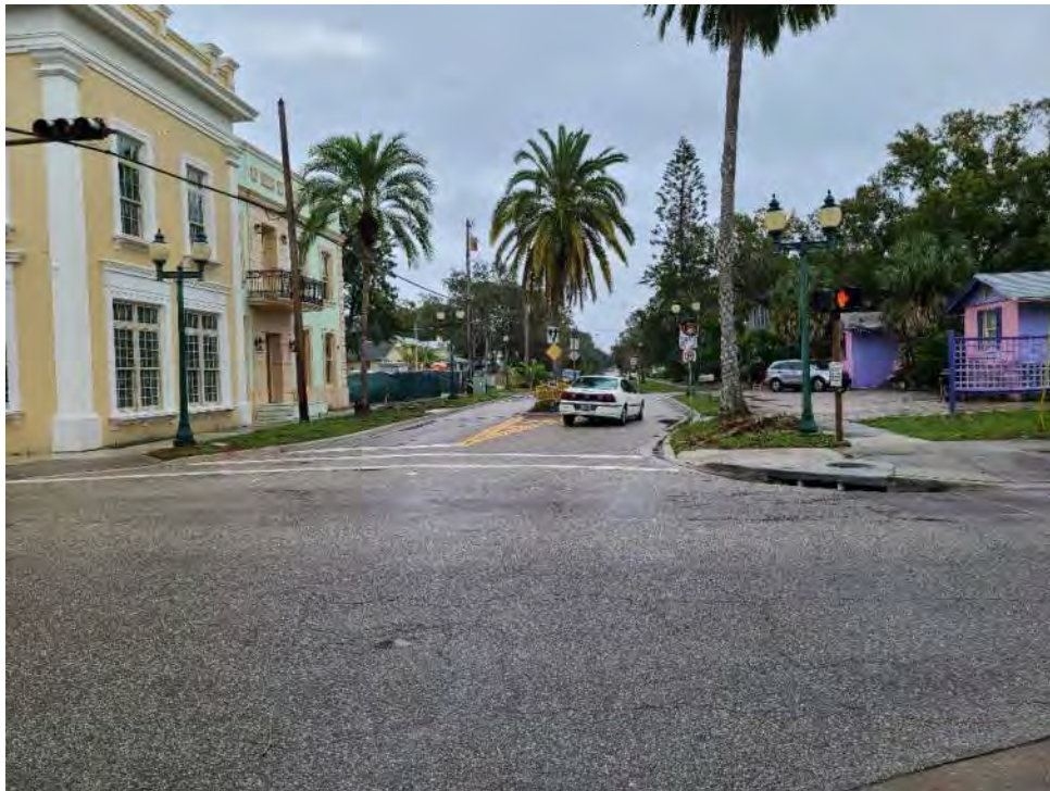
Eastern project boundary Boulevard of the Arts looking east