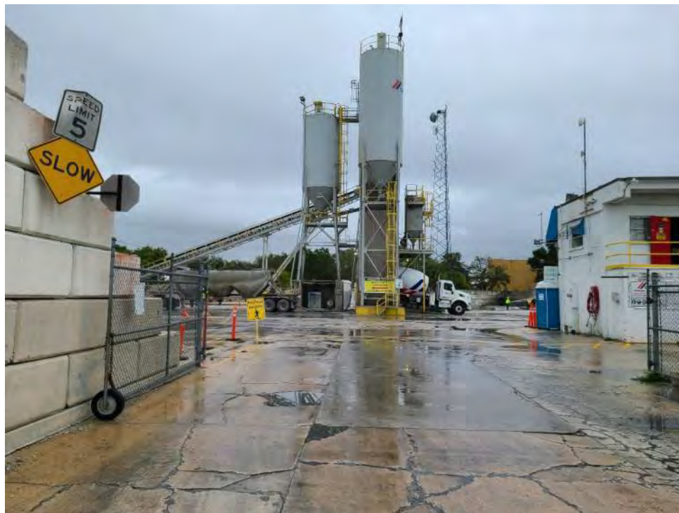
Site 15 – Cemex Central Avenue South Ready Mix Central Avenue looking east