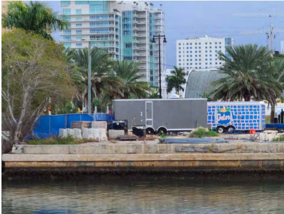
Site 4 – Sarasota City-Centennial Park/ Sarasota City-Helmsman Marina Near north Tamiami Trail looking south