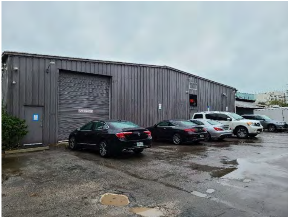
Site 20 – Perfection Water Kumquat Court looking southwest