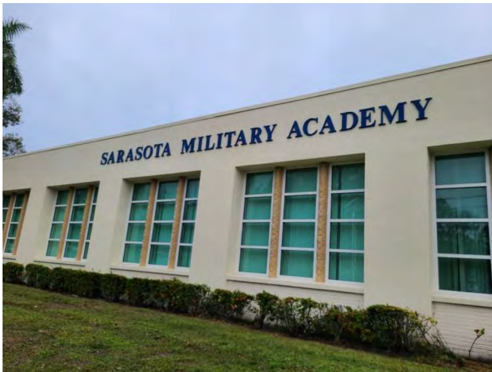
Site 23 – St Marthas School North Orange Avenue looking southwest