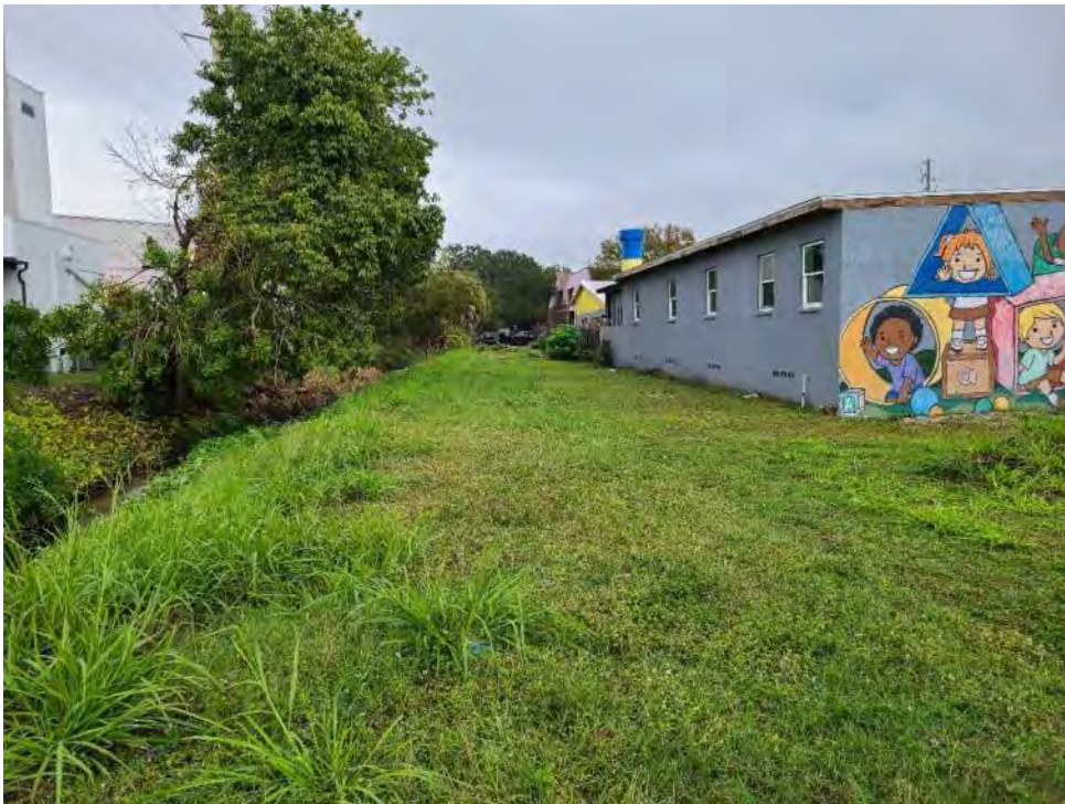
Site 29 – Former 10th Street Railroad North orange Avenue looking east