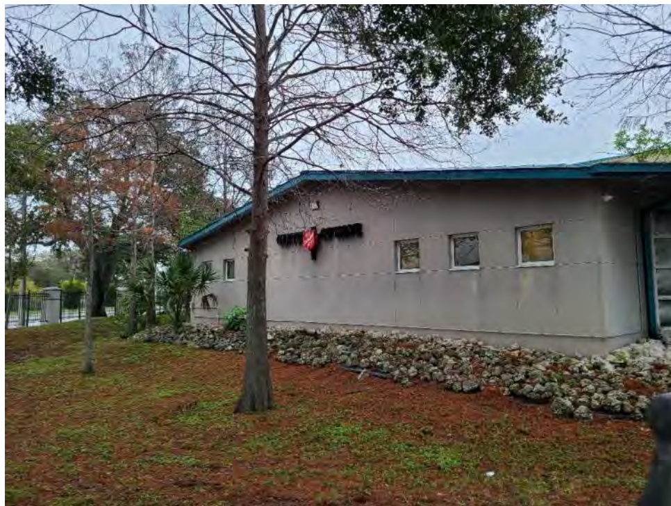
Site 17 – Salvation Army Sarasota Area Command Near 10 th Street looking east