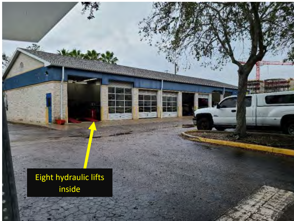
Site 34 – Goodyear Auto Service 4 th Street looking northeast