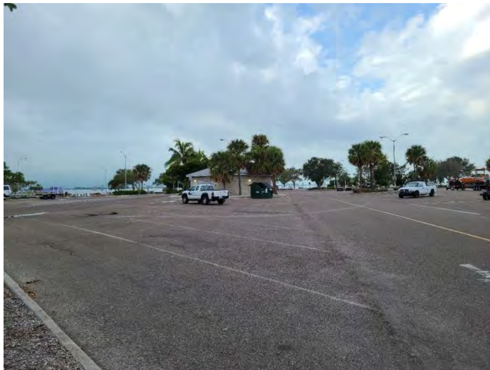
Site 4 – Sarasota City-Centennial Park/ Sarasota City-Helmsman Marina Near north Tamiami Trail looking southwest