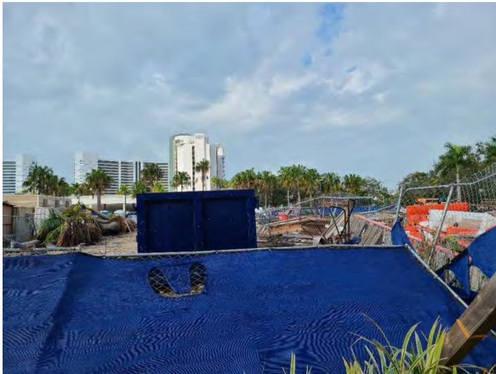
Site 33 – Construction Staging Yard North Tamiami Trail looking west