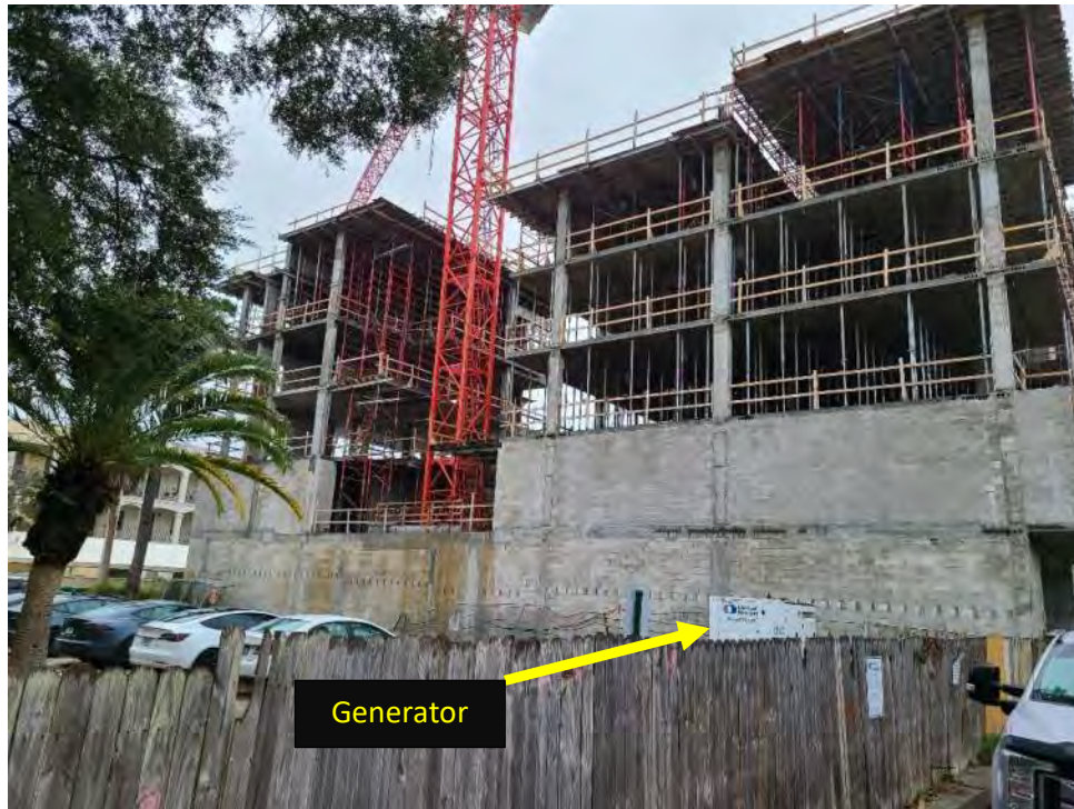
Site 35 – Construction Site Kumquat Court looking southeast