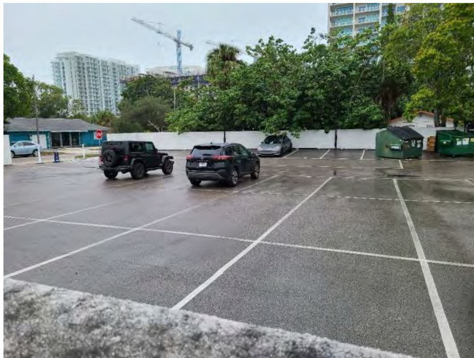
Site 8 – Cocoanut Avenue Well Near Cocoanut Avenue looking southwest