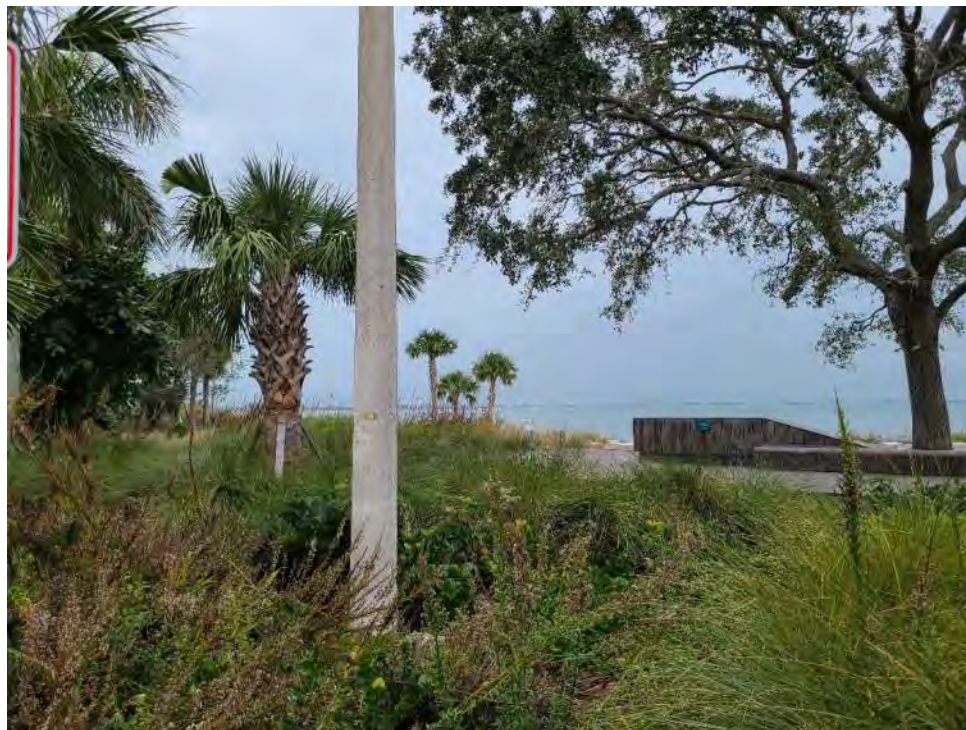
Western project boundary Boulevard of the Arts looking west