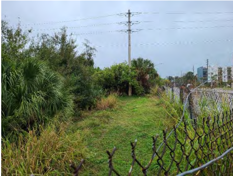
Site 30 – Former Lemon Avenue Railroad Lemon Avenue looking south