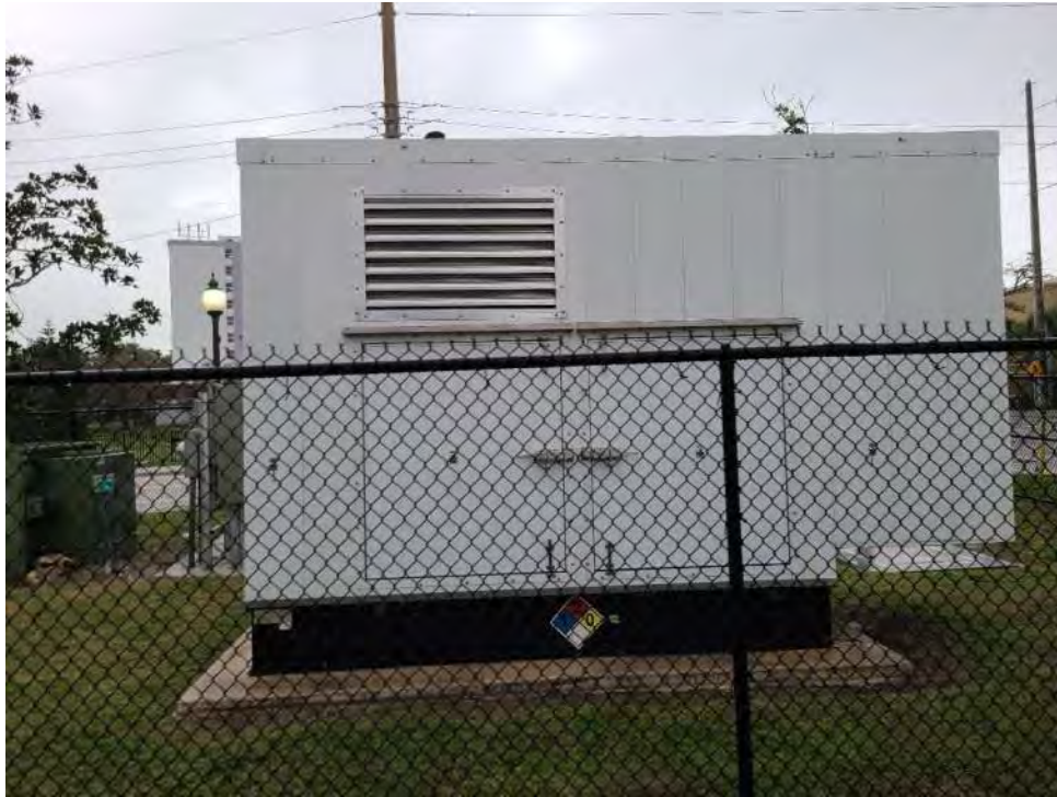
Site 32 – Sarasota City Property Emergency Generator/AST Near 10 th Street looking west