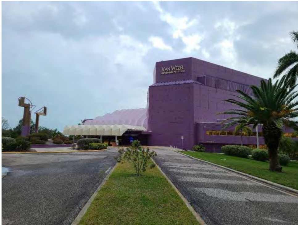
Site 1 – Van Wezel Performing Arts Hall Near Van Wezel Way looking southwest