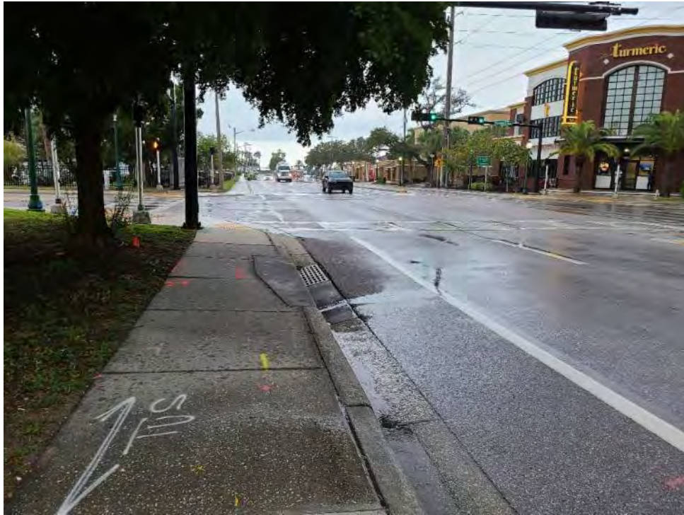
Near western project boundary 10th Street looking west