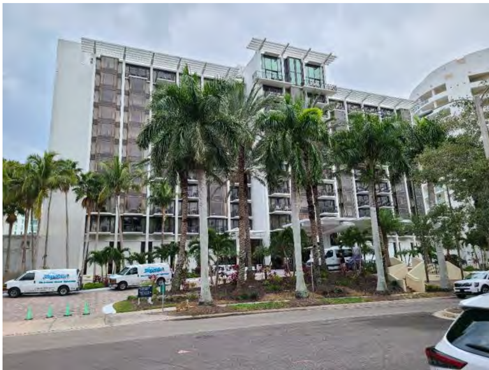
Site 2 – Hyatt Hotel Boulevard of the Arts looking southwest