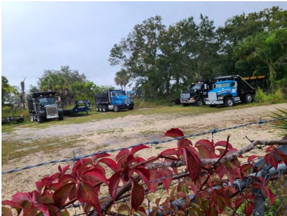
Site 27 – Mechanical Rebuilders Inc. 10 th Way looking northeast