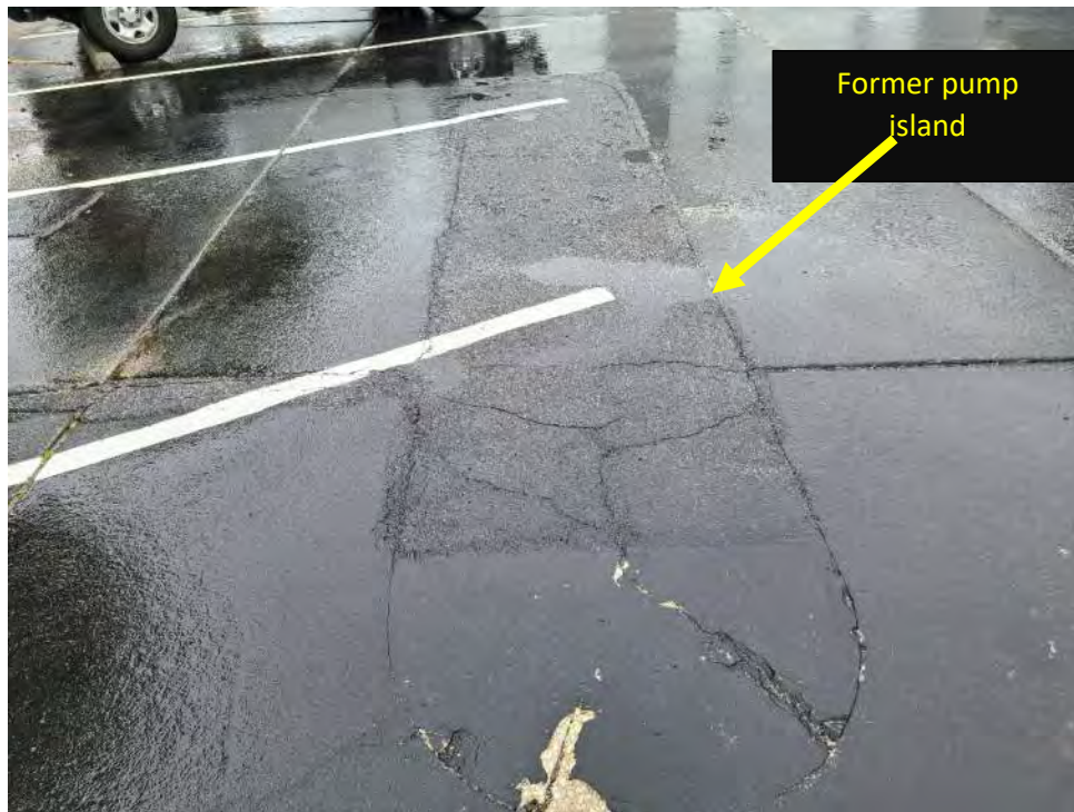
Site 13 – Bruces Automotive Former pump island looking south