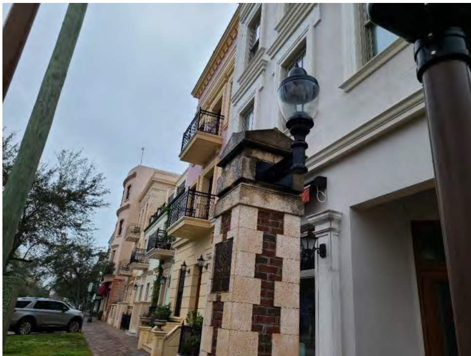
Site 19 – Old Sarasota Icehouse North Orange Avenue looking southwest