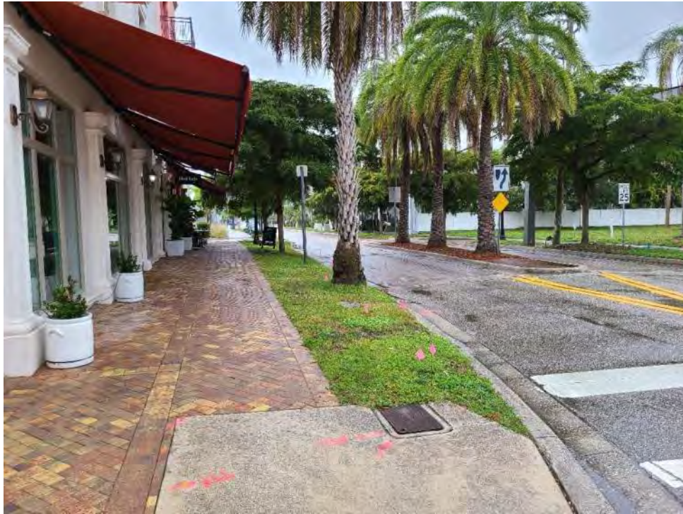
Eastern project boundary Boulevard of the Arts looking west