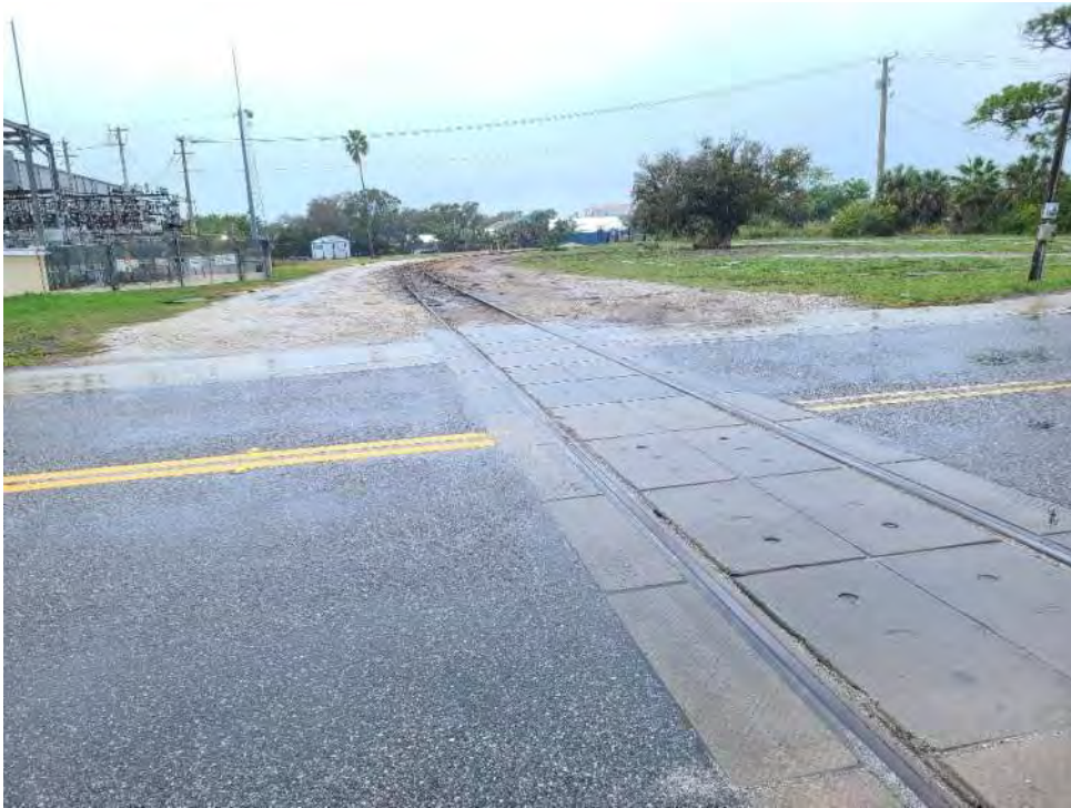
Site 28 – Seaboard Coast Line Railroad North orange Avenue looking northwest