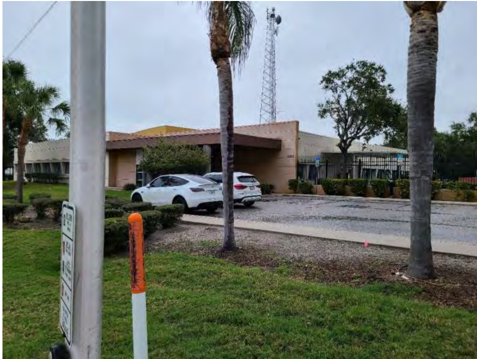
Site 18 – WWSB LLC 10 th Street looking northwest