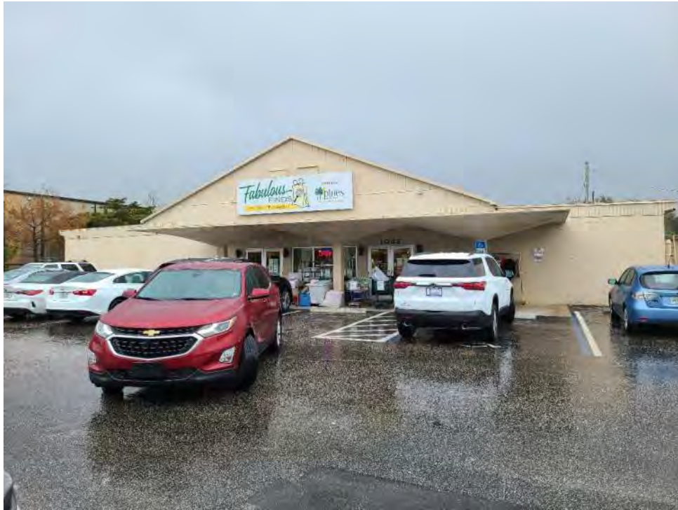
Site 26 – Davis Lumber Company North Orange Avenue looking east