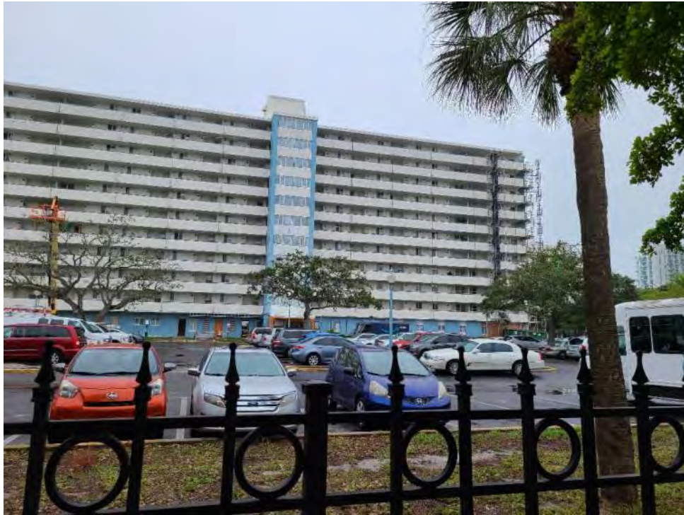
Site 9 – Sarasota Housing Auth Mckown Tower Near Boulevard of the Arts looking southwest