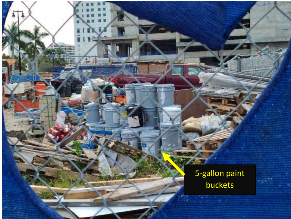
Site 33 – Construction Staging Yard Boulevard of the Arts looking south