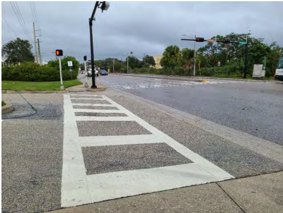
Near eastern project boundary 10 th Street looking east