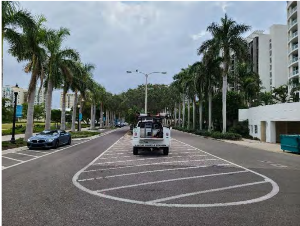
Western project boundary Boulevard of the Arts looking east