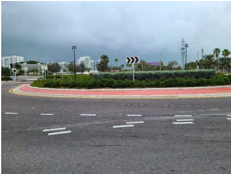
Site 5 – Hog Creek Restoration 10 th Street and north Tamiami Trail roundabout looking southwest