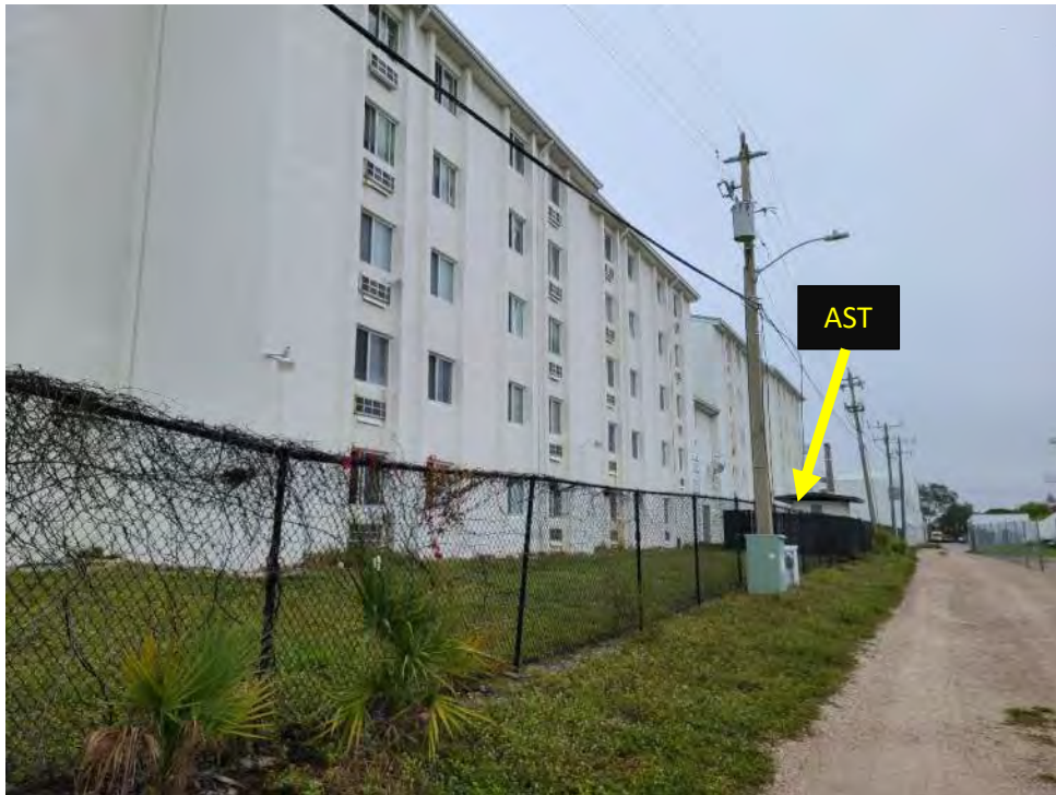
Site 10 – Sarasota Housing Auth Tower Annex Near Coconut Avenue looking northeast