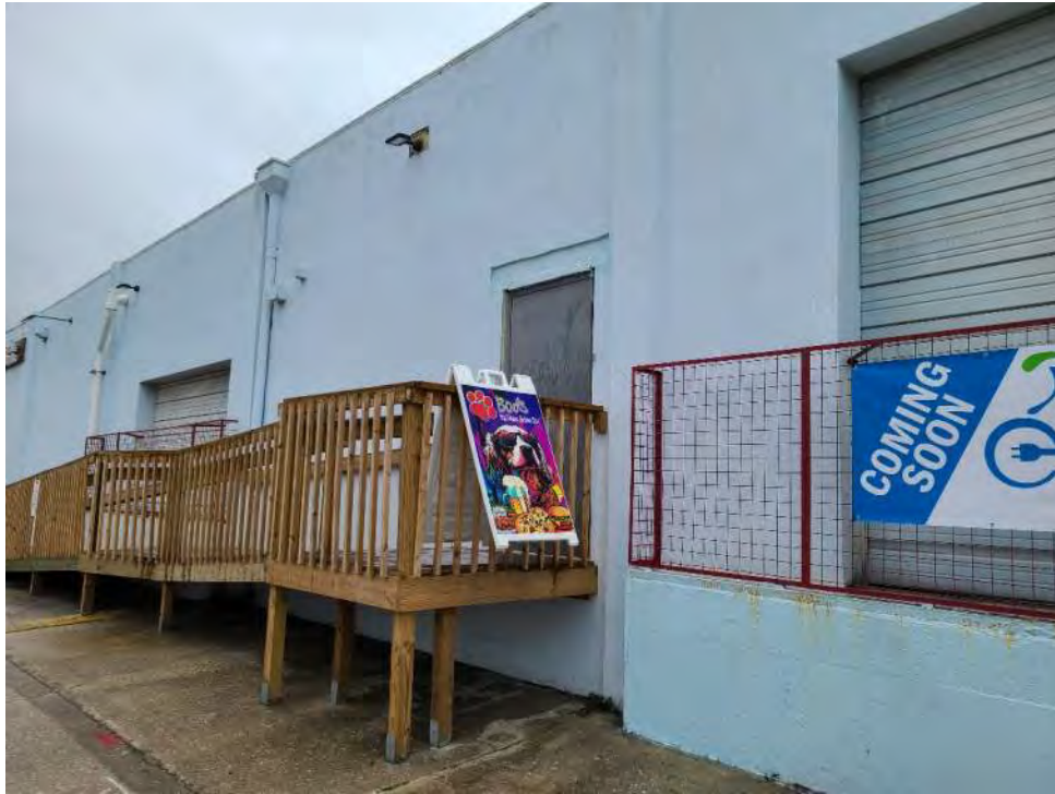
Site 11 – Icehouse Inc. 10 th Street looking southeast