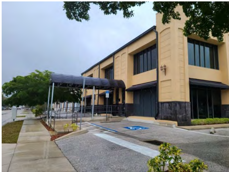
Site 25 – Orange Sota LLC. / Independent Concrete Products North orange Avenue and 11 th Street intersection looking southwest