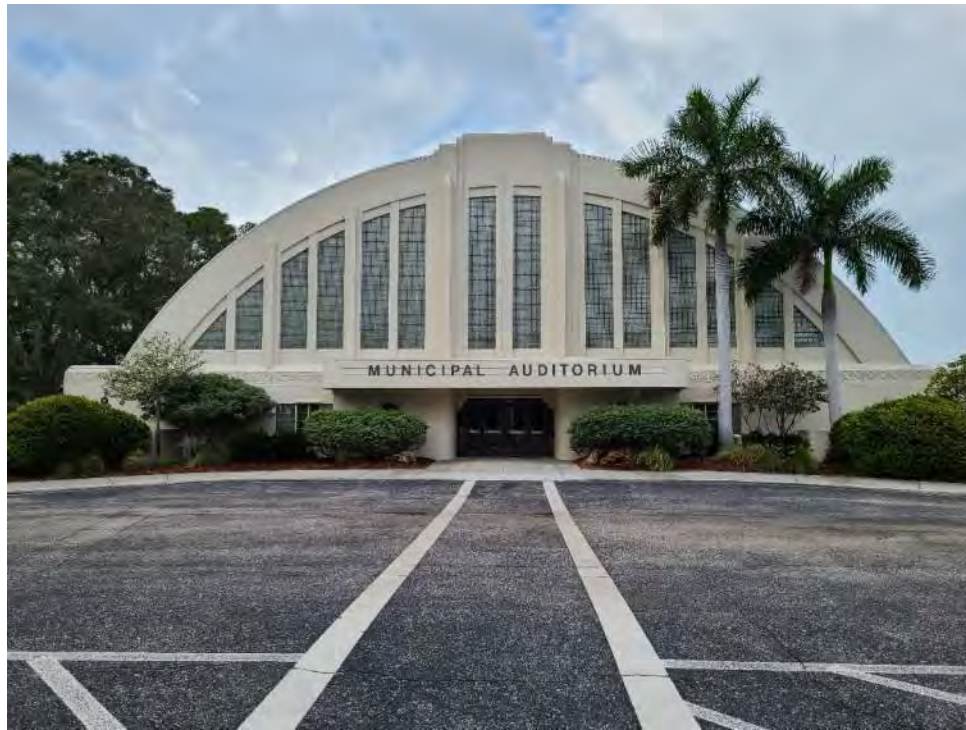
Site 3 – Sarasota City Exhibition Hall Near north Tamiami Trail looking west