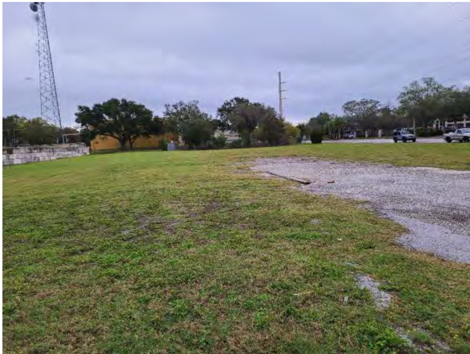
Site 31 – Former Railroad Yard Central Avenue looking east