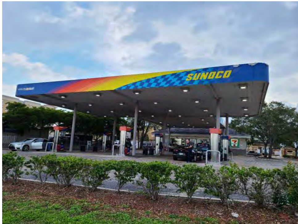
Site 6 – 7-Eleven Food Store #40347 Near north Tamiami Trail looking east