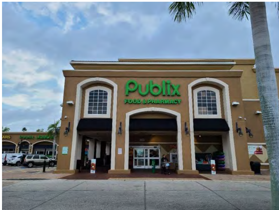
Site 7 – Publix Super Market #1023 Near 10 th Street looking east