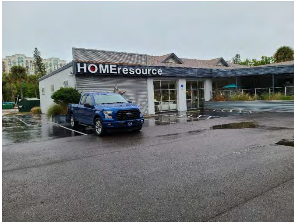
Site 13 – Bruces Automotive Central Avenue looking northwest