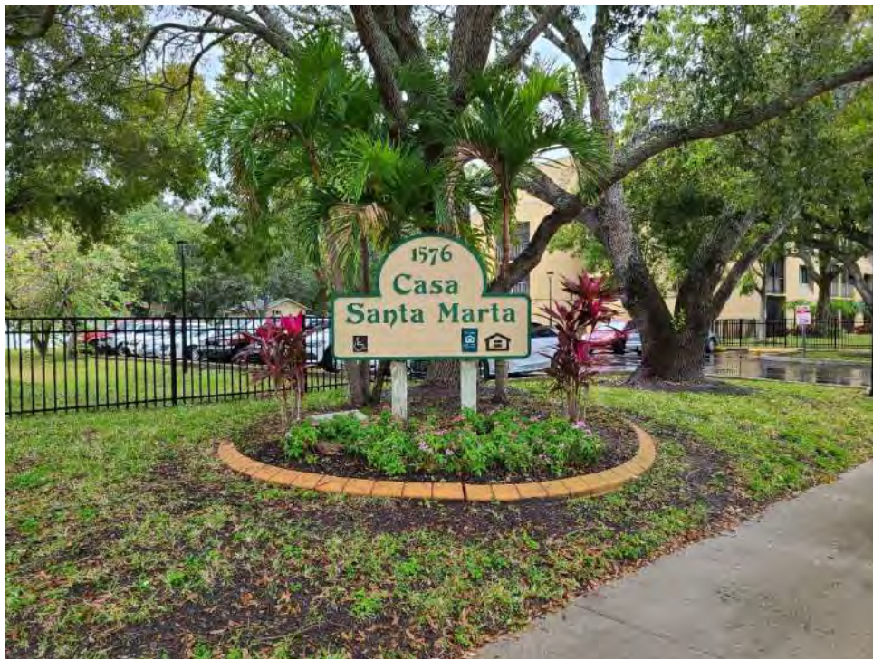
Site 21 – Casa Santa Marta North Orange Avenue looking southwest