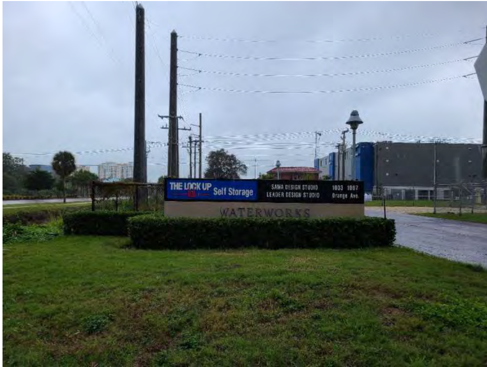
Site 22 – Sarasota City Old WTP Near 10 th Street and north Orange Avenue intersection looking west