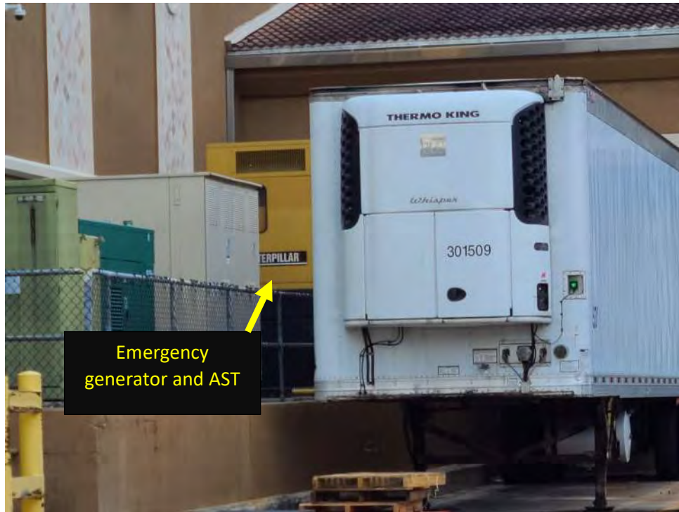
Site 7 – Publix Super Market #1023 Near 10th Street looking northeast