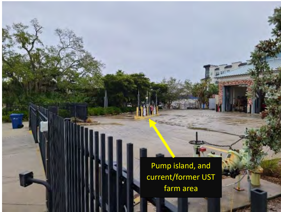
Site 16 – Sarasota County-Fire Rescue Station #1 Near Lemon Avenue looking southeast