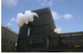
Speech Bubbles Inflatable sculpture installation 16' x 13' x 4' $15000.00 2016