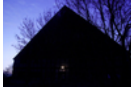
Monument For The Screams A chandelier, broken glass bottles taken from the site 0' x 0' x 0' $28000.00 2012