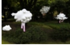
Silver Lining Polyester Resin Cast, Paint Satin Base and Clear 0' x 0' x 0' $75000.00 2017