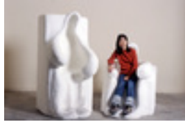
Polar Man Metal Frame, Resin Cast, Artificial Fur 8' x 5' x 5' $45000.00 2014