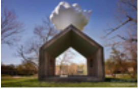
Cloud House FRP Vacuum Casting, Paint Satin Base and Clear 17' x 17' x 26' $250000.00 2016