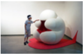
Polar Ball Metal Frame, Resin Cast, Fabric 7' x 7' x 7' $55000.00 2016