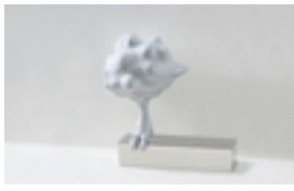
Silver Lining Polyester Resin , Paint Satin Base and Clear 8' x 8' x 3.5' $75000.00 2019