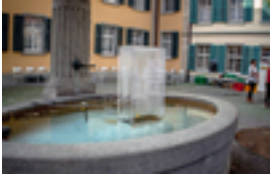
Water Square Polycarbonate, Laser engraving, Water from different countries 24" x 10" x 60" $12000.00 2014